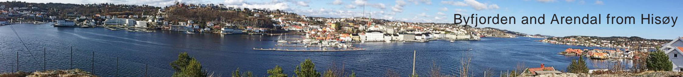
Byfjorden and Arendal from Hisøy