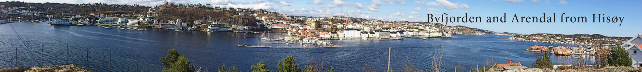
Byfjorden and Arendal from Hisøy