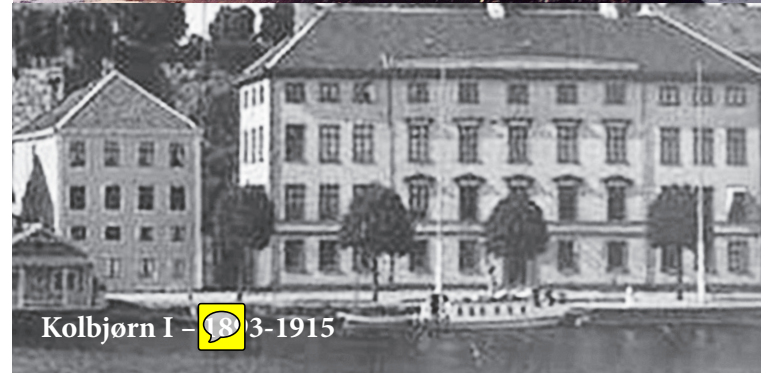
Kolbjørn I – 18-1915